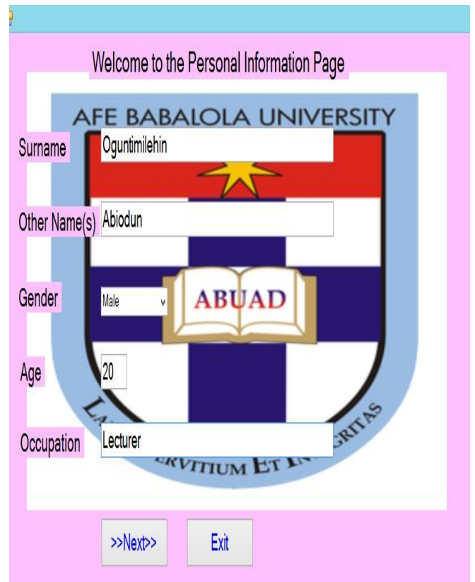
Figure 1: Screenshot of the Front Page.

The user provides their information in the Personal Information Page. After the information is successfully provided, the user proceeds to the Risk evaluation pages. This is where the twenty two (22) questions are made available to the user. Since the questions require Yes/No answers, the user only has to select either a YES or a NO to respond to each question. After this interaction, a submission is made to the system and the system uses the evaluation formula to access the risk level of the user. The screenshot of the Front Page is shown in Figure 1, Personal Information Page is shown in Figure 2, Risk Evaluation pages are shown in Figures 3 and 4 while HIV Risk Prediction/Result page is shown in Figure 5. Figure 6 is a page which avails the user the opportunity to print the result of the evaluation.