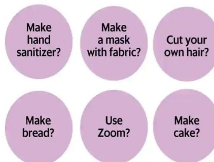
Figure 2: What are people searching online?

Through this study we observed that as the pandemic has spread, along with it fear and uncertainties have also prevailed. Fig. 1 and 2 tells us how people have turned to Dr. Google for answers to questions like "What are the symptoms of coronavirus?". Others have turned for questions like "How to", for example "How to use google meet?" and so on. Globally, search for coronavirus has