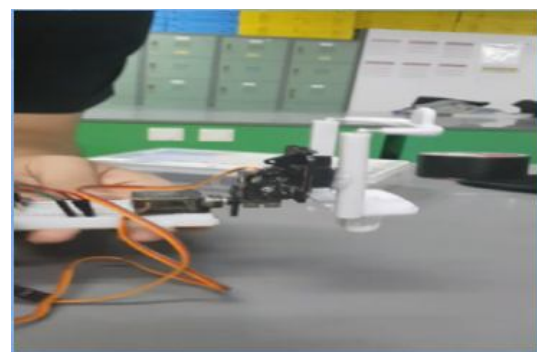
Figure 2: Smartphone Holder Prototype Trial with a gimbal system