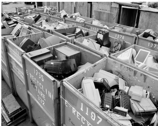
Figure 3: E-waste Recycling containers for shipping purpose

countries, the removal of the machines, sometimes in person, but progressively by automated screw-in systems, in separate sections. Usually, NADIN is in Novi Iskar, Bulgaria, the largest of its kind in Eastern Europe, E-waste recycling plants. The rewards are the capacity of the human employee to identify and secure operating and reworkable materials, including processors, transistors, RAMs, etc. The downside is that with the lowest health and welfare requirements the population is cheapest. 8 About 8% of E-dust is estimated to be dumped in high income countries such as Australia as seen in figure 3 in waste container tanks, while 7% - 20% is shipped. That benefits through recycling were enhanced as sustainable recycling techniques were being used. Conscious recycling throughout the U.S tries to lessen potential risks to public health as well as the atmosphere involved with storage including destruction of appliances 2 .