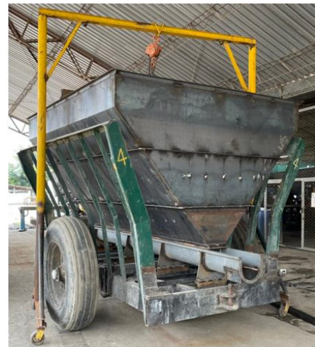
Figure 9: Transport System Assembly

In Figures 7 and 8, it can be seen that gates were fitted to the system to allow the dosage of the product in the endless system, and gates in the lid, in such a way that the distribution of the product in the hopper is homogeneous.