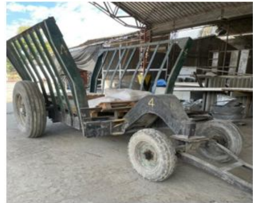
Figure 4: Sugarcane wagon

alternatives, being the most suitable for transport capacity and adaptation to the terrain, the purchase and adaptation of certain vehicles used in the transportation of sugar cane, which are anchored to a tractor and move easily in areas of difficult access, the selected vehicle is shown in Figure 4.