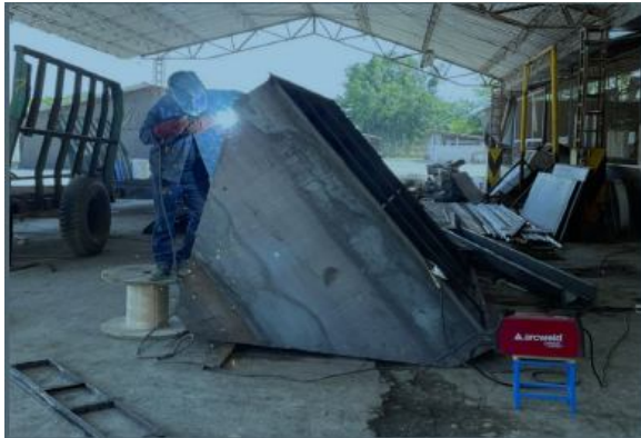
Figure 6: Hopper Construction

During the construction phase, other changes and adaptations to the system were implemented, in such a way that its operation would be the best and most suitable for the company. Figures 6 - 9 show part of the construction of the transportation system.