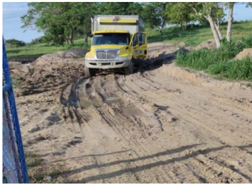
Figure 2: Conditions of access to the company.

Although the characteristics of the vehicles used today are ideal for this type of journey, the roads become impassable, interrupting the collection and distribution, this affects the production process, since it generates additional costs by having to look for a solution to give continuity to the food supply process, many times you have to wait a long time until the roads improve