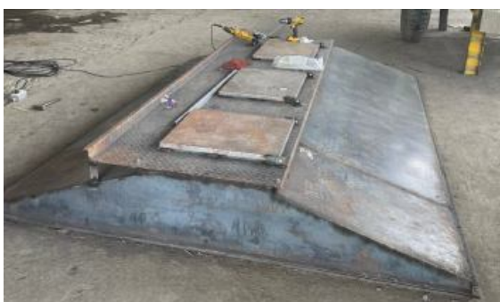
Figure 8: Cap and System Fill System