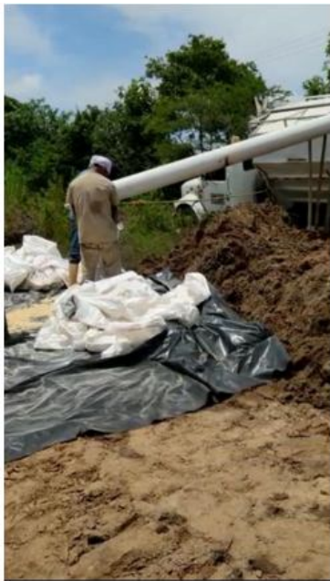
Figure 3: Unloading of food on the company's roads

This fact means that the company's production is restricted at certain times of the year, when the rains are quite frequent, which means that on many occasions the trucks have to wait for a long time for the road to improve or for the Products must be unloaded on the roads and carried by pack animals to the company warehouses, which causes multiple inconveniences, as indicated in Figure 3.