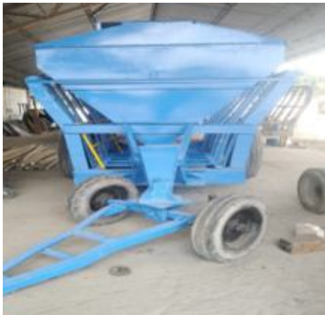
Figure 11: Finished poultry feed transport system