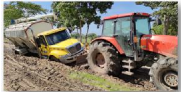
Figure 1: Conditions of access to the company.

As mentioned above, the climatic conditions at certain times of the year make the access routes to the company difficult, as indicated in Figures 1 and 2.