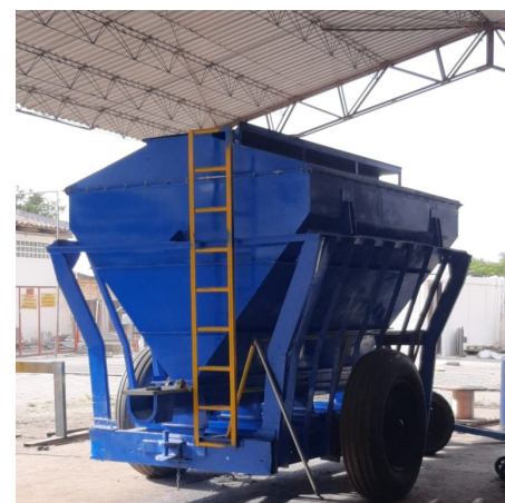
Figure 10: Finished poultry feed transport system