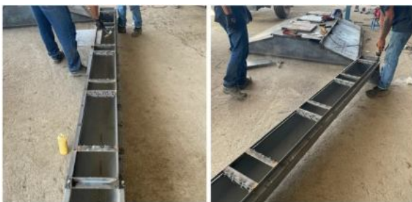
Figure 7: Construction of the endless system

Subsequently, the respective equipment operation tests were carried out, for which an operation and maintenance manual was developed. The system was then delivered to the company and tested under the difficult conditions of the company's roads, as indicated in Figures 10 and 11.