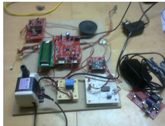
Fig.1: design without power supply