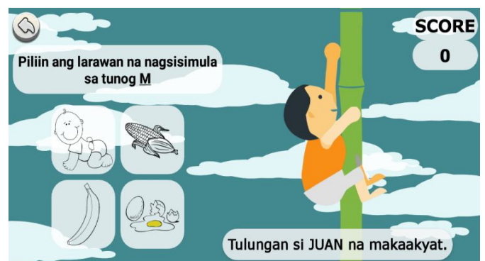
Figure 1: Example screenshot of LaroLexia that integrates game elements such as story, clear goals and objectives, and points.

Figure 1 shows an example of a screenshot of LaroLexia. This learning media integrated different game elements such as story, clear goals and objectives, and points. At the start of the game, the researchers incorporated a simple short story in the application to catch the attention and increase the motivation of the dyslexic children. The story in this application shall narrate using the audio before the level start and there is a short lecture on how to read and sounds the letters and syllables for the dyslexic user. The researchers chose this theme because most of the children are familiar with the fiesta event and in this case, most of the children's games at the barangay fiesta are Filipino's native games. The story in this application is "There is a child name Juan who invited by his friend to come in their house for the celebration of the barangay fiesta, unfortunately, he forgot the direction to go in the house of his friend, to be able to see his friend house he needs to participate to the games, can you help Juan to win the games by identifying the correct image that starts the name with the letter or syllables displayed on the screen or correct letter or syllables missing in the word displayed on the screen"