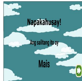
Figure 4a: Positive

immediate feedback messages will pop up every dyslexic user's response. The feedback is in the form of a positive if the user gets the right answer and encouragement feedback is provided for any user's wrong response to prevent the dyslexic user's negative impact. Figure 4a shows the example of positive feedback given to the dyslexic user for every correct answer and the Figure 4b example of encouragement feedback to the user.