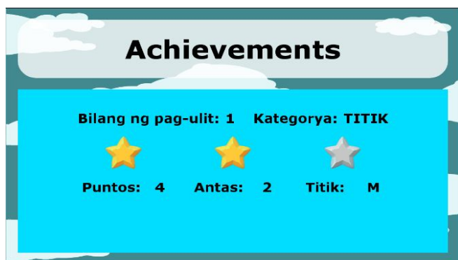
Figure 3: Achievement System in LaroLexia

The LaroLexia achievements system displays the user's mastery in every level of the category. When the user perfects the points for each level, the level is marked as a gold star, the user will earn a silver star if the number of levels with a perfect score is only 3 to 4 levels, then the bronze star will be displayed. Figure 3 is an example screenshot of the achievements system in this application. In the achievement system, the number of tries, category, score, and level is shown.