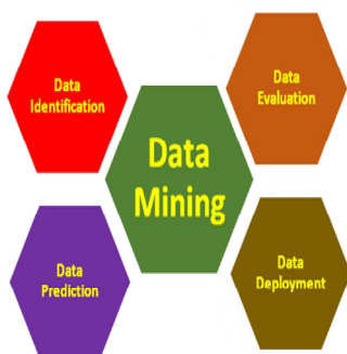
Figure 1: Data mining concept

Data mining may be new in the educational field is to be taken on an important point to recognize our understanding of the learning process, as well as students to evaluate variables associated with the process of learning as worship Thacker As explained by [3]. Mining in the educational environment of educational data is called mining. Abdul Hameed [1] Data mining describes the software aimed at allowing users to analyze data from disparate dimensions, sort it and connects those relationships which are recognized for the duration of the mining process. Data mining is acknowledged as educational mining to a new technology. In educational mining, data mining concept are applied to data that is connected to field of education. It is the development of remodeling the data assembled by education systems. Educational mining means analyzing out of sight data that come from educational settings by means of new methods for improved considerate of students and background they learnt. Data mining concept have presented the various view at figure 1.