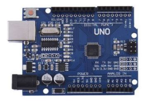
Figure 6: Arduino Uno R3 Pin Layout

then edited the code that is being used by ESP8266 to implement both sensors.