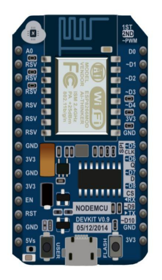
Figure 5: ESP8266 Pin Layout

The prototype is then placed underneath the lid of the waste bin as seen in Fig. 3. The prototype will then read anything it senses underneath the waste bin. The waste bin attached is a 60-liter bin with dimensions of 330mm in length, 330mm in width and 889mm in height. Shown in Fig. 4 is the actual bin being tested upon. An RFID transmitter can be used to send the information [22,23,24,25].