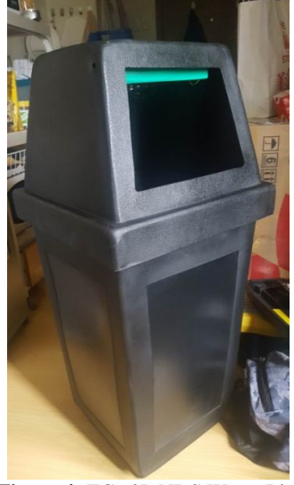
Figure 4: TC 60L NDS Waste Bin

Fig. 2 shows the schematic diagram of the system. The battery is connected to the voltage source of each microprocessor. The VCC, Trig, Echo and GND of the ultrasonic sensor was connected to 3v3, D1, D2 and GND, respectively, of the ESP8266. D7 and D8 pins of the ESP8266 were then connected to the digital pins 3 and 2, respectively, of the Arduino Uno R3. The Output pin, VCC and GND of the infrared sensor was connected to the A0, VIN and GND of the Arduino Uno R3, respectively.