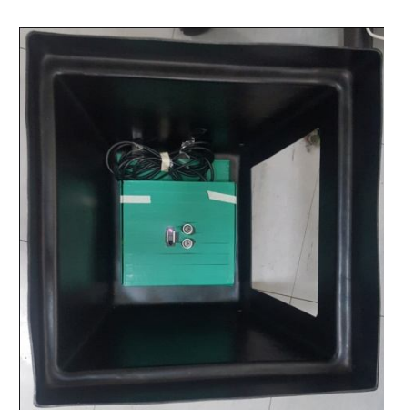
Figure 3: Actual Prototype

Fig. 5 shows the ESP8266 with its pin layout. Using the ultrasonic sensor, the group soldered the VCC, Trig, Echo and GND to its corresponding pins which are 3v3, D1, D2 and GND, respectively, to access the sensor and apply our created code using the Arduino IDE. Since the IR sensor needed a 5v connection, the group used pins D7 and D8 to connect to the Arduino Uno R3. Spatial Processing can be used to optimize it [26]. Another optimization method that can be used is Neural Networks [27].