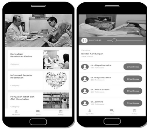
Figure 3: Interface Application