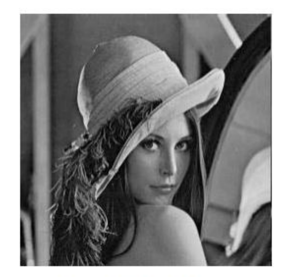
Figure 4. Original Image

The SPIHT algorithm was implemented using MATLAB. Our preliminary results are as follows, Figure 4 shows the original Lena image, Figure 5 illustrates the wavelet pyramid tree Treated by using the bi-orthogonal wavelet bior4.4 in MATLAB [2]) and Figure 5 shows the recovered image using up to 5th bit plane (from the maximum of 13 bit-planes). The recovered image is visually very close to the original mage. If all the bit planes are used then the original image is recovered completely (up to rounding errors). Although the MATLAB version of the SPIHT runs slow no attempt was done to optimize the code as for instance in8,9. The authors' aim was to have an implementation ready for students to experiment with. Students' familiarity with MATLAB and accessible tools in it will allow them to easily modify the code and reduce development time. For instance one method is already explored in10 by modifying the SPIHT algorithm using Lossy/Lossless region of interest (ROI) coding. In a similar fashion our students can modify the algorithm to include different methods of ROI coding.