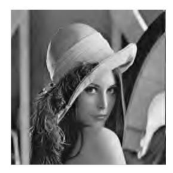
Figure 6: Recovered image at 5th level