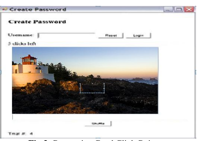
Fig 3: Persuasive Cued Click-Points

To deal with the problem of hotspots, PCCP was proposed. As with CCP, a password consists of five click points, one on each of five images. During password creation, most of the image is dimmed except for a small view port area that is randomly placed on the image. Users must select a click-point within the view port. If they are unable to select a point in the current view port, they may press the Shuffle button to randomly reposition the view port. The view port make the users to select more random passwords that are less likely to include hotspots. A user who is firm to reach a certain click-point may still shuffle until the view port moves to the specific location.