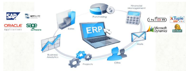
Figure 1. ERP is central to many businesses.

Globally, the developed countries applied and implemented the ERP system for regularization and improvement of their business streams to meet worldwide competition. They have to overcome the economic, cultural and basic infrastructural barriers. This applies to large, medium and even small scale units. The various difficulties and barriers arise from capital limitations, lack of availability of resources, poor management and etc. ERP is at the infancy stage in developing countries when compared to the developed countries. This work concludes that enterprises in developing countries pay little attention towards ERP systems. As shown in Figure 1, ERP system is central to every business that brings standardization, transparency, globalization, automation, and integration across departmental functions.