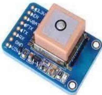
Figure 1: GPS

GPS stands for Global Positioning System by which anyone can always obtain the position information anywhere in the world and Location of women along with an emergency Short Message Service (SMS) is sent to police and relatives by GSM module. Global System for Mobile (GSM) is an architecture used for mobile communication in most of the countries.