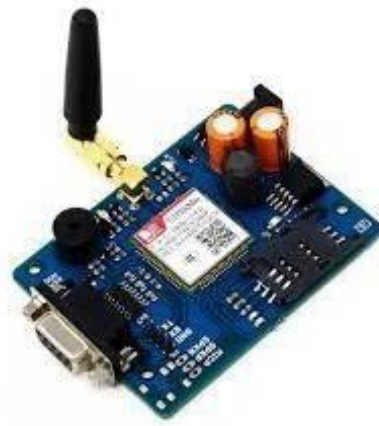
Figure 2: GSM