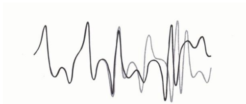
[fig (1) "The Butterfly Effect"]