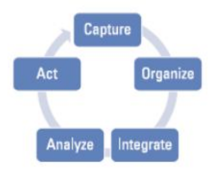
Figure 2: The cycle of Big data management

As data has become the fuel of growth and innovation, it is more important than even to have an underlying architecture to support growing requirements. But before delve in to the architecture, the data must first be captured[3,4] and then be organized and integrated. After the successful implementation of this phase, data can be analyzed based on the problem being addressed. Finally, management takes action based on the outcome of that analysis. Figure 2 shows the cycle of Big data management.