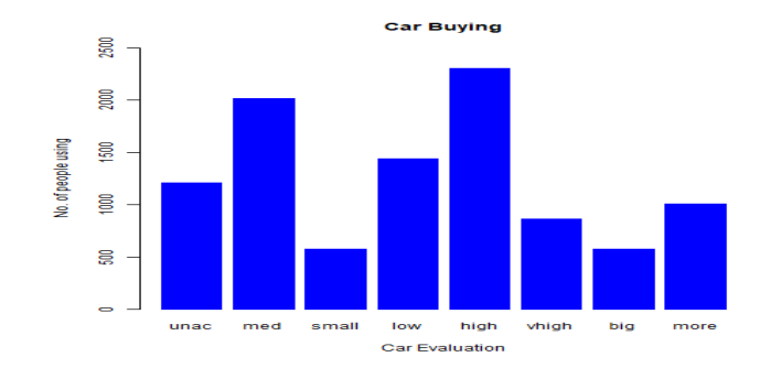
Figure 4: Results showing the comparison of the BNDM algorithm