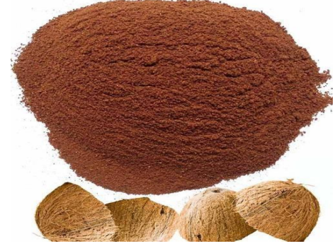
Fig-3: Coconut shell powder 3. MANUFACTURING OF SPECIMEN 3.1Components for compression test

In the preparation of coconut shell powder first we removed the Endosperm and then we removed Exocarp and Mesocarp. Now these coconut shells are hammered in to small pieces. These pieces are sending to the machining process and we had collected coconut shell powder of unknown grain size. These powders divided into different grain size i.e. 50,100,150,200 microns