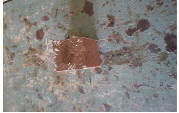
Fig-4: CompressionTest Specimen 3.2 Components for Impact Test

hours. After the curing the laminate was cut into required size of various mechanical tests. By using same procedure we prepare different composite rods by using different ratios.