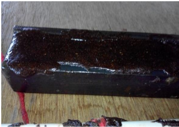
Fig-5: Impact Test Specimen

The test sample which is used to find the impact strength is in the form of bar type with dimensions 75mm \times 13mm \times 13mm. It was sawed from the composite samples so as to have smoothed edges free from cracks. First of all we take the two 'L' angle rods and cut these rods until to form a required shape and assemble of these bar shaped rods with the help of welding in order to form a bar shaped mould. For quick and easy removal of the composite bar apply oil to the mould. The weight presents of coconut shell powder, egg shell powder, teak wood powder in the different ratio, was mixed with the matrix material consisting of epoxy resin and hardener these mixture mixed thoroughly then poured into the mould. Care was taken to avoid formation of air bubbles during pouring and mixture was allowed to cure at room temperature for 24 hours. After the curing the laminate was cut into required size of various mechanical tests. By using same procedure we prepare different composite rods by using different ratios. The specimens are prepared as per as ASTM