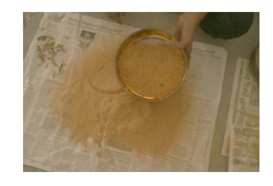
Fig -2: Teak wood powder

These collected teak wood were converted in to powder form in MIXY but we don't know the grain size of these particles. we required exact uniform grain structure so we divided the teak wood powder in to different groups based on grain size so we collected 150 microns grain size