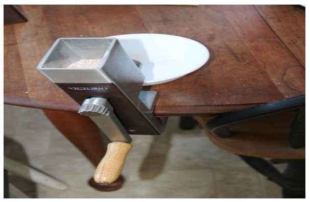
Fig -1: Egg shell powder

We collected large amount of egg shells from a local seller. These collected egg shells are exposed to sunlight for drying process. After drying these egg shells were dipped into the sodium carbonate solution for cleaning purpose .After cleaning the inner layer which is present inside these shells was removed by us. In this we cleaned nearly 100-150 egg shells. These are ready to prepare egg shell powder. These collected shells were converted in to powder form in MIXY but we don't know the grain size of these particles. We required exact uniform grain structure so we divided the egg shell powder in to different groups based on grain size..so we collected 150 microns grain size