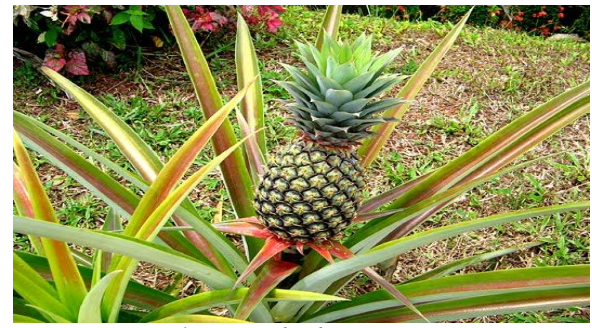
Figure1. Pineapple plant

With growing environmental awareness, ecological concerns and legislations, Eco fiber reinforced plastic composites have received increasing attention during the recent decades. The composites have many advantages over traditional glass fiber and inorganic materials. In this paper, tests are conducted for composite material constitutes less discovered pineapple as filling materials. These composites are adhered using epoxy resin consists resin and hardener suitably mixed in appropriate volume. Here for preparing samples Hand layup method is used, specimens are prepared and tests are carried out. The compressive tests were applied