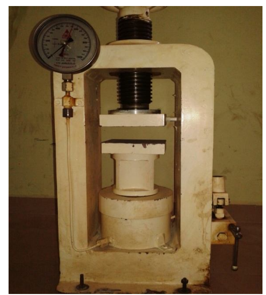
Fig 3. Compression Testing Machine