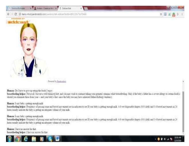
Figure 3: Screenshot of the Chatbot Interface

Over 100 FAQs and relevant responses were identified. A ChatBot was developed in the program Pandorabot. Chatbot included 80 responses, 40 keyword and wildcards. The Chatbot was published online (Figure 3).