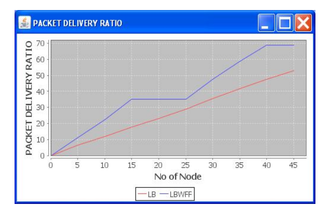
Figure 3 shows Packet delivery ratio

Packet delivery ratio is defined as the ratio of the number of delivered data packet to the destination. Figure 3. Shows that packet delivery ratio of existing local broadcasting method and the proposed local broadcasting with firefly algorithm. This shows that the proposed method has high packet delivery ratio when compared to the existing method.